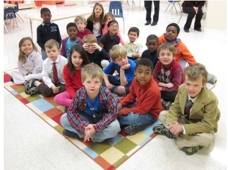
Our Grade 1-3 Sunday School class, March 25, 2012

Parkdale United Church 429 Parkdale Ave.