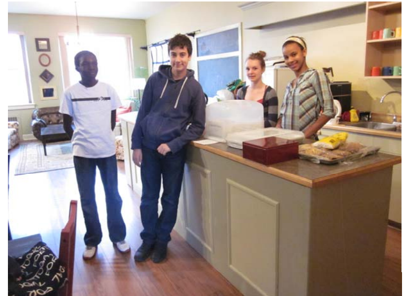
Youth prepare for the Second Blessing Coffee Shop opening on Sunday March 25, and it was an active group, as usual, in the bright new Nursery (below).