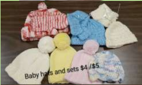
Baby hats and sets $4 / $5