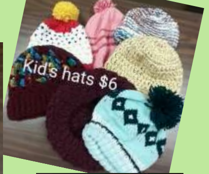
Kid's hats $6