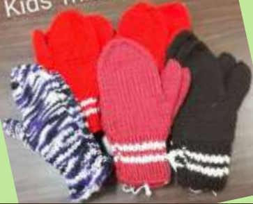
Kids' mitts $3