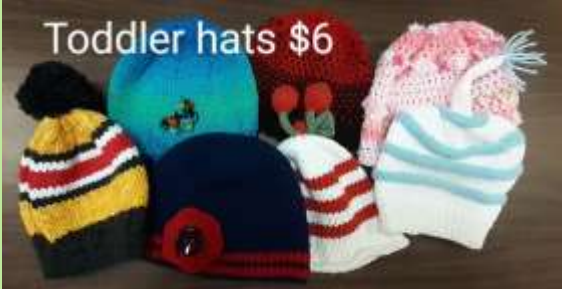
Toddler hats $6