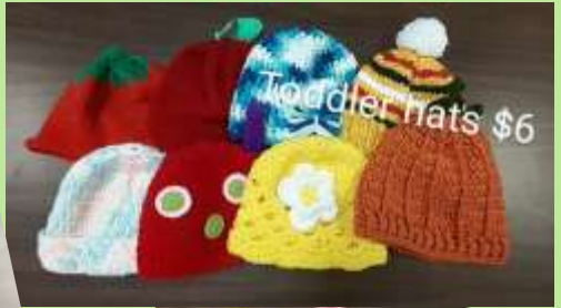
Toddler hats $6