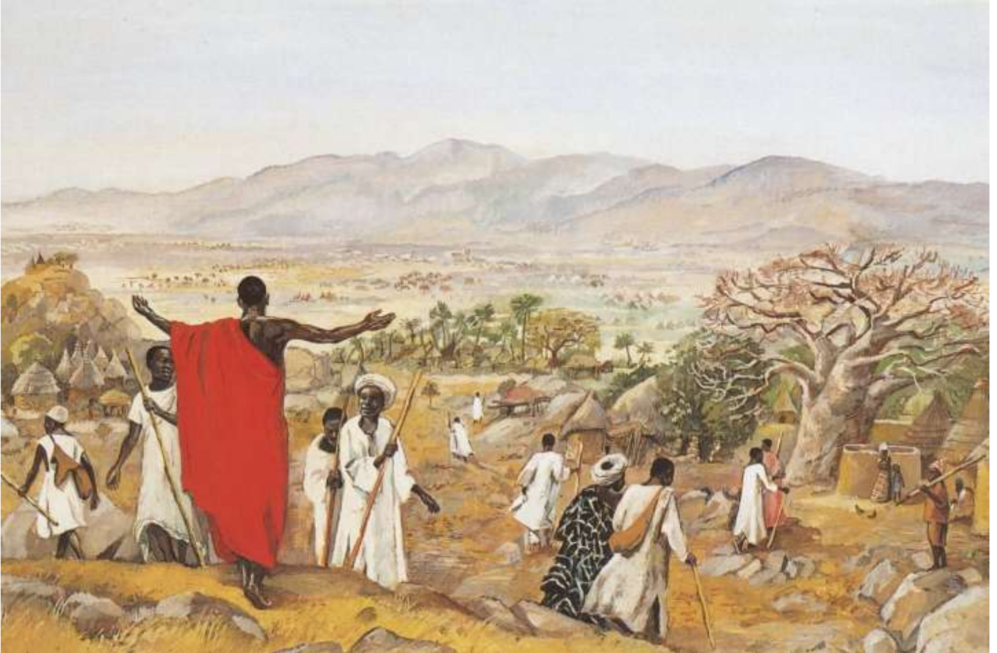
The Mission to the World by Jesus Mafa 1973

Trinity Sunday May 31, 2026 – 10:30 AM Theme: Always with Us